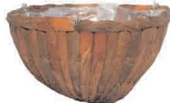
#16 PALM BARRELL

Dimensions and capacity are subject to change as products are handmade.