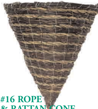
#16 ROPE & RATTAN CONE