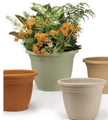
*Also available in Sandstone.