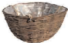
SOLID COLOR VINE