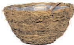
MOSS HANGING BASKET