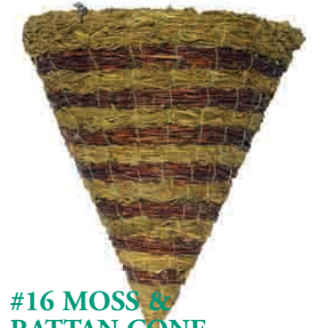
#16 MOSS & RATTAN CONE