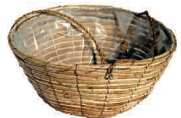
BI-COLOR RAFFIA - REED