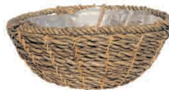
SOLID COLOR RAFFIA - REED