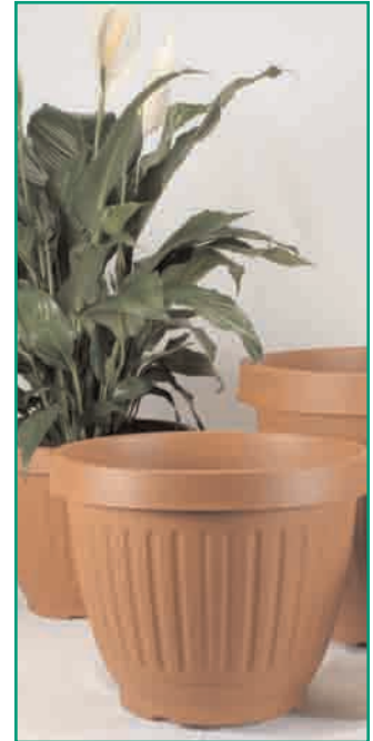
*Also available in Sandstone.

ITML QUANTITY DISCOUNTS 10 cs., less 5% 25 cs., less 10% 50 cs., less 15% Call for further discounts.